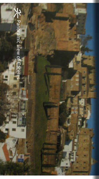
Panoramic view of Cáceres

2g. The last stretch of this route passes by an aerodrome and crosses a grove of scattered oaks, and continues up the Olivenza valley to the end point of this route, next to the Piedra Aguada reservoir and 4.1 km west of Valverde de Leganés.