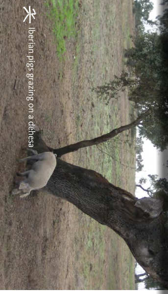
Iberian pigs grazing on a dehesa