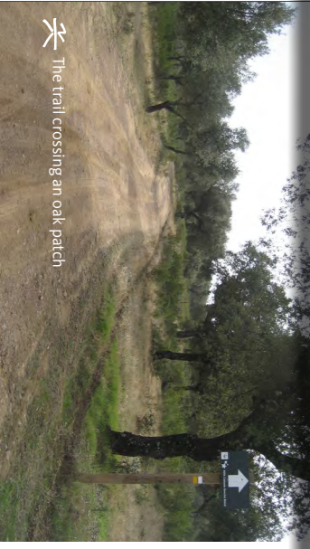
The trail crossing an oak patch