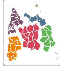
SECTOR NORTHWESTERN PENINSULAR