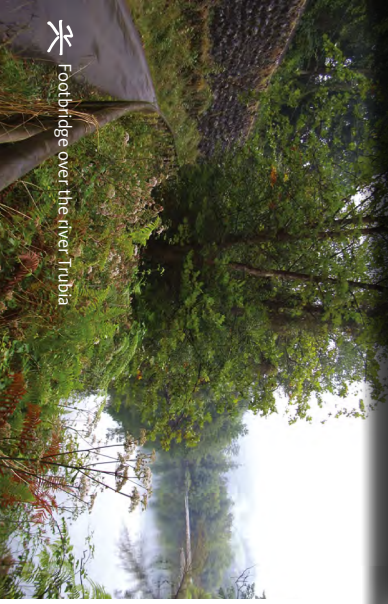
Footbridge over the river Trubia