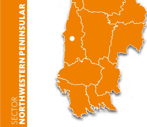
SECTOR NORTHWESTERN PENINSULAR

This 16-kilometre route links the greenway that connects Fuso de la Reina and Parque de Invierno de Oviedo with the Senda del Oso, starting in Tuñón and running through meadows, chestnut woods and riparian forests along the banks of the rivers Nalón and Trubia.