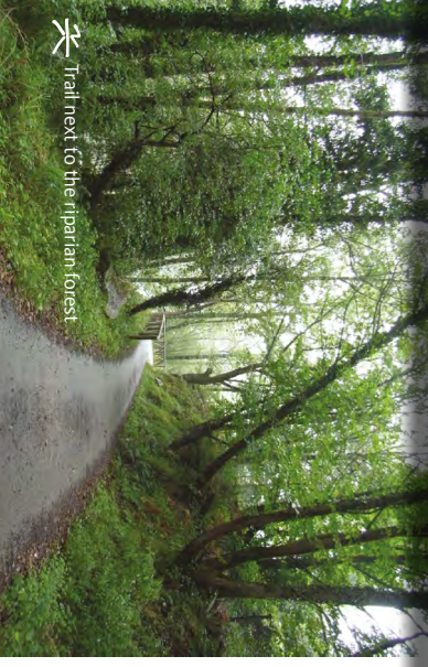
Trail next to the riparian forest