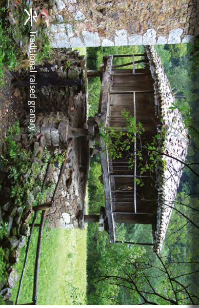
Traditional raised granary