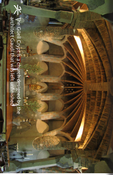
The Güell Crypt is a church designed by the architect Gaudí that was left unfinished