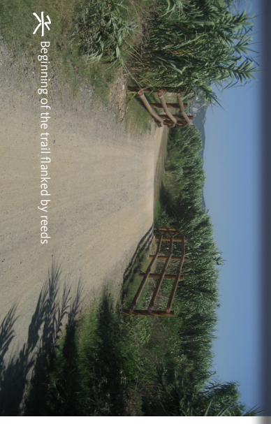
Beginning of the trail flanked by reeds

Regarded as a reference when studying the architecture of Antonio Gaudí, this small workers' neighbourhood which is passed through by the nature trail is also one of the most important modernist ensembles and tourist attractions of Catalonia. It is worth taking a break from your route to admire the Güell Crypt, a church designed by Gaudí which was left unfinished on the death of Eusebi Güell, his patron.