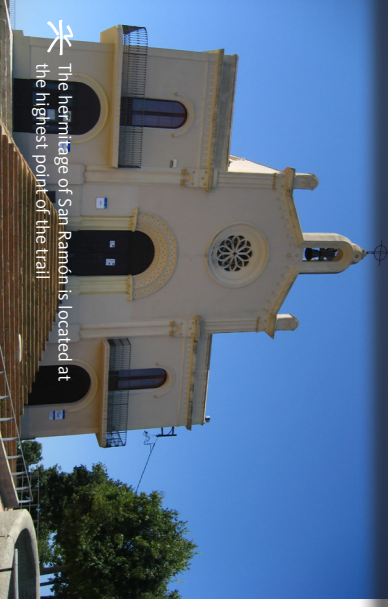
The hermitage of San Ramon is located at the highest point of the trail