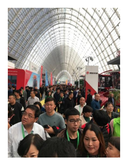
Over 125,000 persons attend CIAME.