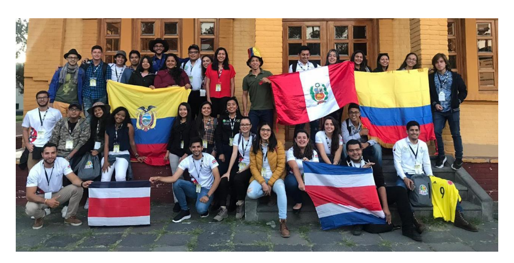
Latin-American and the Caribbean Agricultural Engineering Students attending the X CLEIA at the Chapingo Autonomous University, Mexico.

For more information you can contact the email <u>agricola.acreiab@gmail.como</u> or <u>agricola.aleia@gmail.com</u>