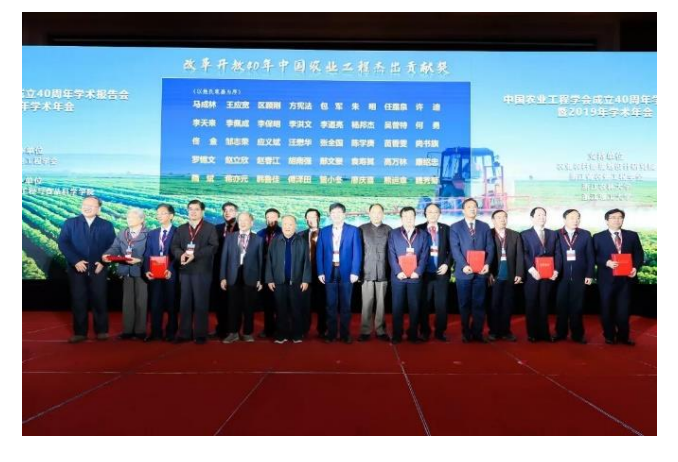
Recipients of "the outstanding contribution award of CSAE for 40 years after reform and opening-up"

The conference presented "the outstanding contribution award of CSAE for 40 years after reform and opening-up", "the eighth Youth Science