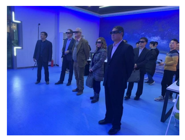
Virtual Reality (VR) teaching facility.