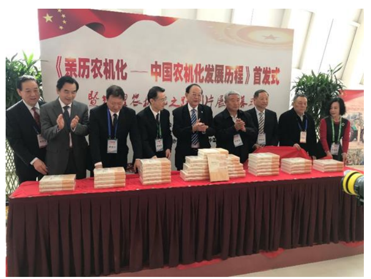
Unveiling of new book on agricultural machinery.