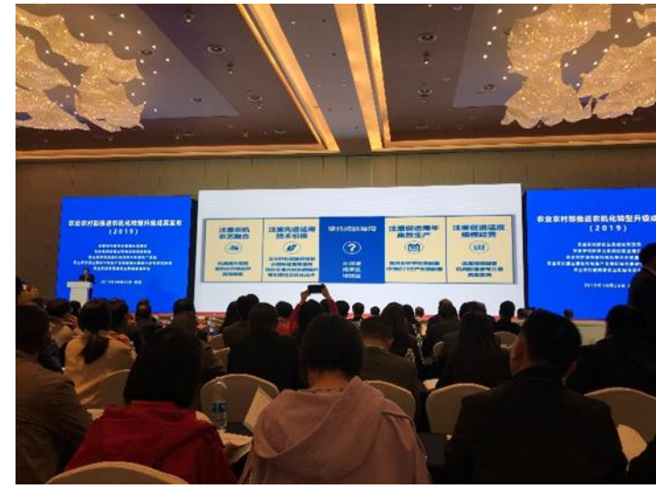
Opening Session of the Technical Conference.

Machinery Distribution Association (CAMDA), The China Agricultural Mechanization Association (CAMA) and The China Association of Agricultural Machinery Manufactures (CAAMM).