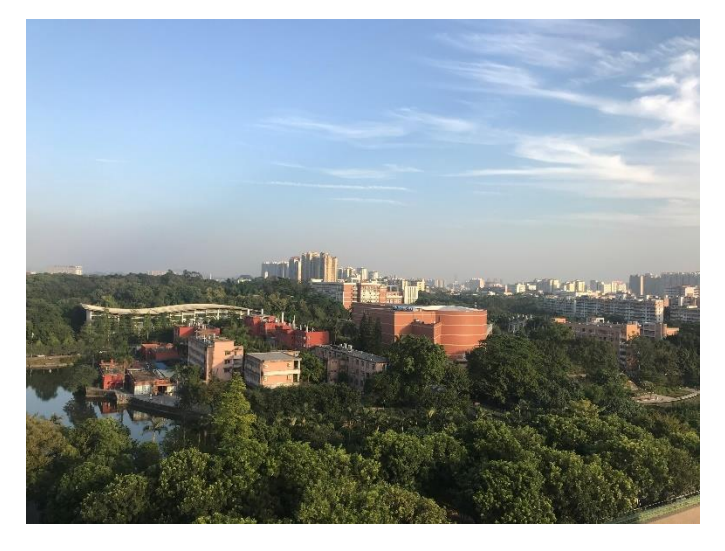
The SCAU campus is 550 hectares with a substantial fraction of green spaces.

South China Agricultural University (SCAU) was founded in 1909 as Guangdong Province agricultural experiments station and Affiliated Institute of Agriculture. It was renamed to its current nae in 1984 and holds the rank of Cultivated High-level University. SCAU has approximately 43000 students including nearly 5500 graduate students.