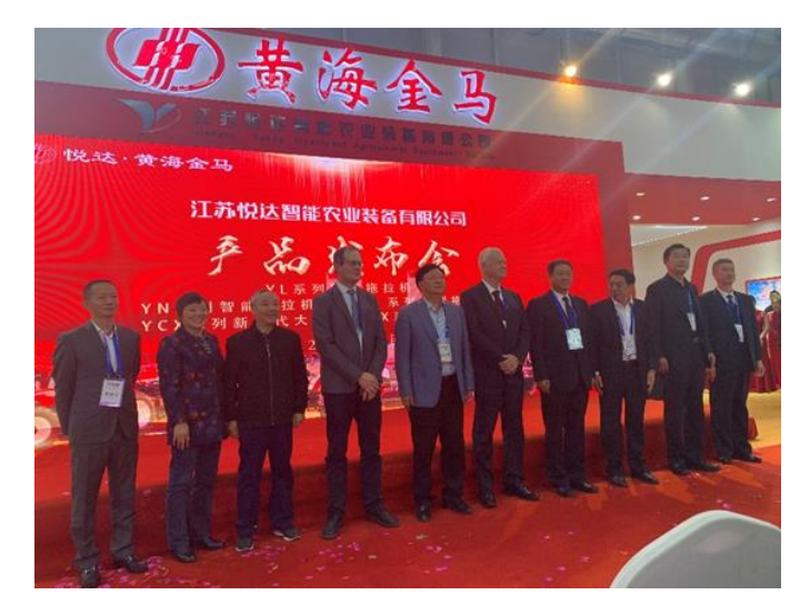
CIAME is a showcase for the introduction of innovation in agricultural machinery.