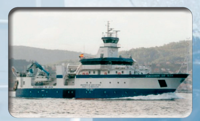
B/O Vizconde de Eza