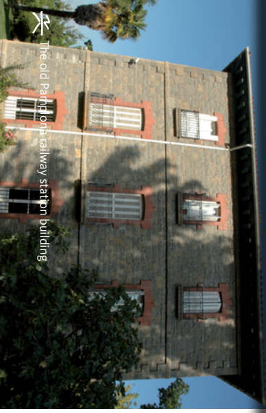
The old Pamplona railway station building

In addition to the monuments of the historic centre, which is also a stop on the Camino de Santiago, the Plaza del Castillo and Plaza de la Ciudadela stand out for their many emblematic buildings such as the Palace of Navarra, the Cathedral, the churches of San Nicolás and San Saturnino, the Museum of Navarra, the Oteiza Museum, the General Archive of Navarra, the Gardens of La Taconera, the Baluarte,