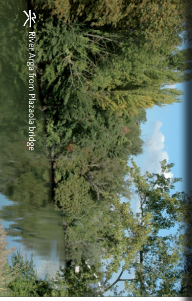
River Arga from Plazaola bridge

The Noáin aqueduct is another great attraction of this city. The works were carried out between 1783 and 1790 for bringing drinking water to the city of Pamplona. The aqueduct, which is nearly 17 km long, starts at the Subiza spring and ends in Pamplona, running along another spots in Tajonar, Badostáin and Medillorri. It once was a 1,245 metres long aqueduct over 97 stone and brick arches, of which 94 are preserved today and it has columns reaching up to 18 metres in height and a channel on the top. Its most emblematic part is located in the municipality of Noáin.