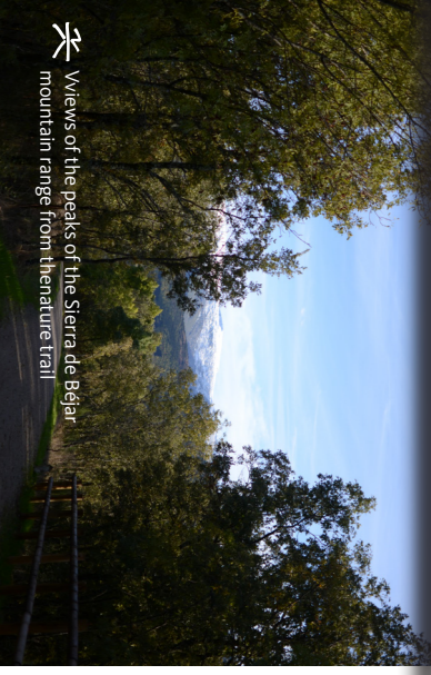
Views of the peaks of the Sierra de Béjar mountain range from the nature trail