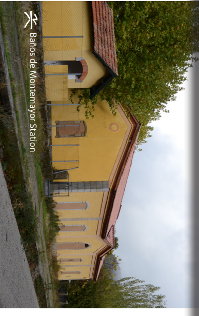
Baños de Montemayor Station