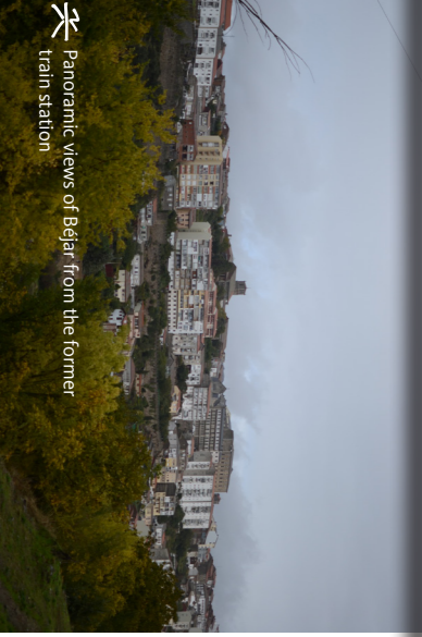
Panoramic views of Béjar from the former train station

The large variety of flora provides a high diversity of habitats populated by more than 5,000 species of invertebrates and 300 vertebrates. Two endemic species stand out among these for their importance: the ray-finned fish and the lizard of the Peña de Francia, as well as keystone species such as the salamander, the black and griffon vultures, the Bonelli's eagle, and mammals such as hunting species for example boar, deer and the Iberian lynx.