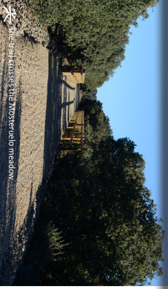
The trail crosses the Mosteruelo meadow