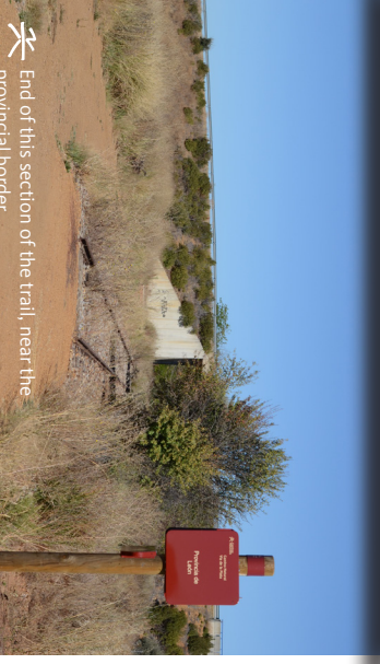
End of this section of the trail, near the provincial border