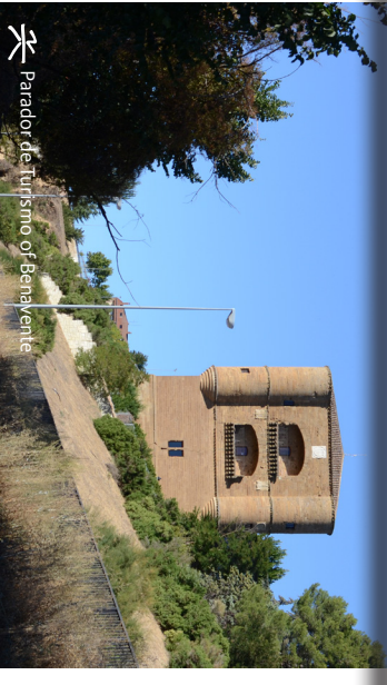
Parador de turismo of Benavente