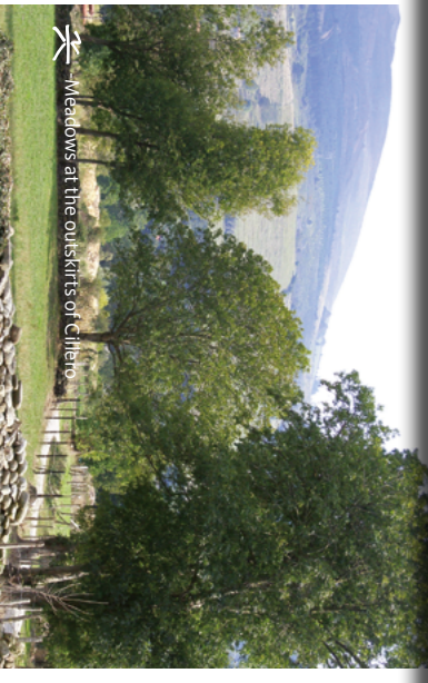
Meadows at the outskirts of Cillero

This establishment opened in 2001 and has all the amenities of a modern hotel. It is located in a large park with centenary trees by the River Pas, right in the town of Alceda. Its unique location, in the geographical centre of Cantabria, allows visitors to enjoy thermal water and, at the same time, visit some of the most significant tourist sites in Cantabria.