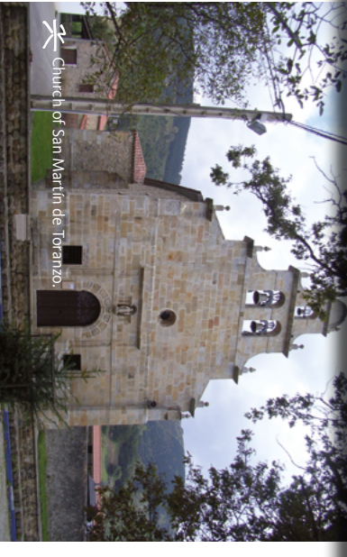
Church of San Martín de Toranzo