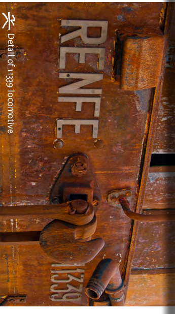
Detail of 1939 locomotive