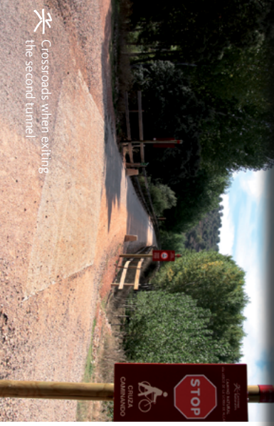
Crossroads when exiting the second tunnel